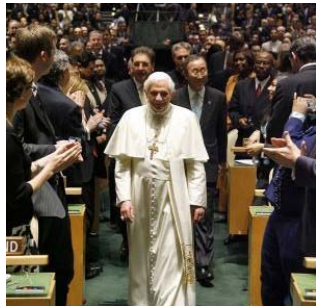
Permanent Representatives and delegates welcome His Holiness at the General Assembly.