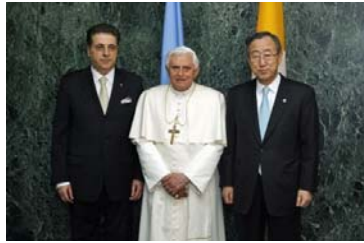
Secretary-General Ban Ki-moon (right) and Srđjan Kerim (left), President of the sixty-second session of the General Assembly, welcome His Holiness Pope Benedict XVI, upon his arrival.

25 East 39th Street New York, NY 10016 Phone: (212) 370-7885 Fax: (212) 370-9622 E-mail: office@holyseemission.org