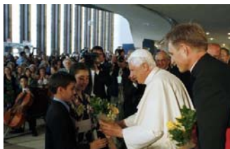
United Nations International School Students welcome His Holiness Pope Benedict XVI.